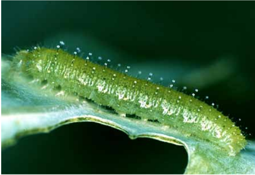
Cabbage worm, with “defensive hairs glistening like Christmas ornaments.”