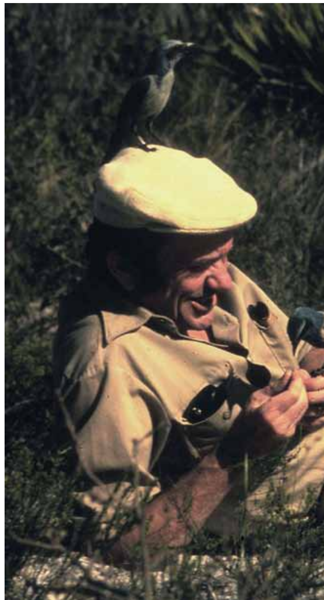
Florida scrub jays getting their lunch. ☰