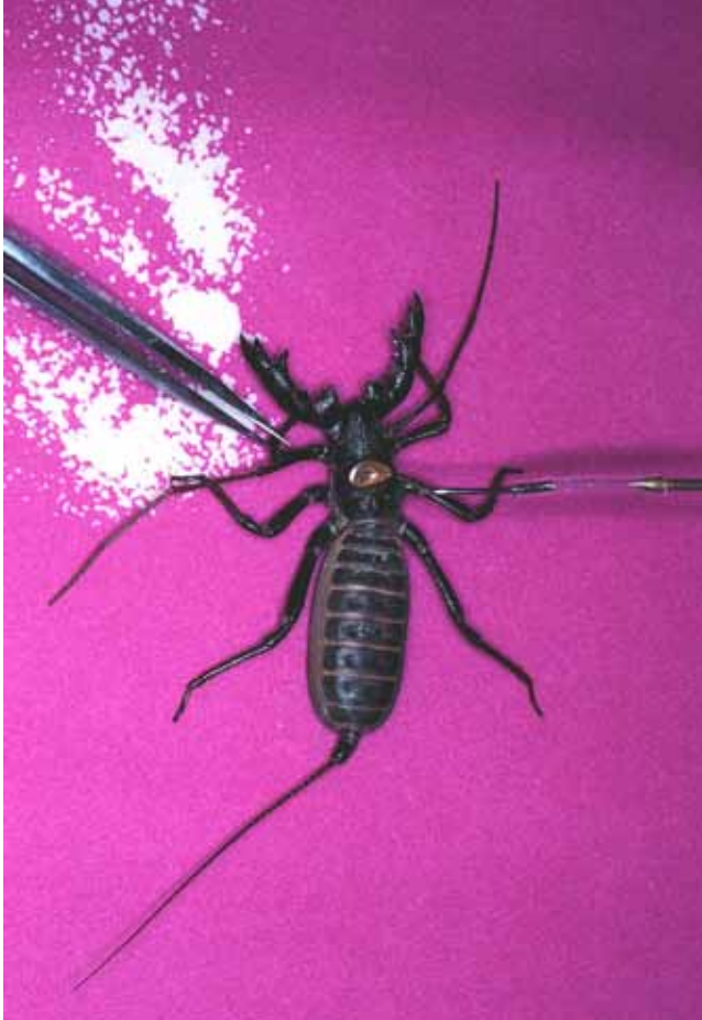
Whip scorpion on pH indicator paper.